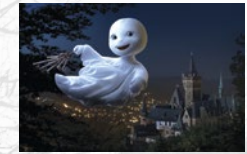
The Little Ghost