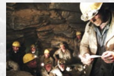
A Light in Dark Places