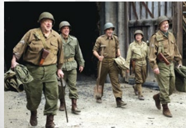
The Monuments Men