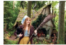
The Little Witch