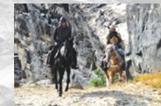
1½ Knights – In Search of the Ravishing Princess Herzeline