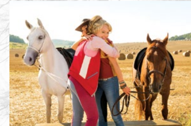
Bibi & Tina – Girls vs Boys